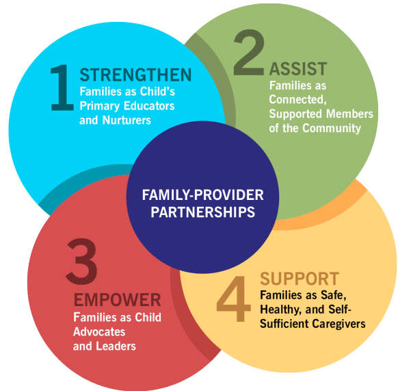
Family Engagement Focus Areas

By achieving those outcomes, programs can influence the attainment of the Family Outcomes listed below the Program Outcomes. The combination of program and family outcomes work together toward achieving the ultimate child outcomes listed at the bottom of each page.